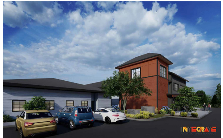
A rendering of the Urgent Care Center, a priority project.

The bond would add a nonprofit Urgent Care Center and funding for the Ocean Park Clinic to equip an additional procedure room for women's health, family planning, urinary incontinence treatment, and annual wellness exams.